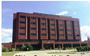
ESH — Regan Unit, Cranston

Our focus is on recognizing each patient's individuality and their right to dignified and high-quality care.