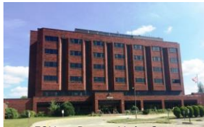
ESH — Regan Unit, Cranston

Our focus is on recognizing each patient's individuality and their right to dignified and high-quality care.