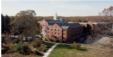
ESH — Zambarano Unit, Burrillville