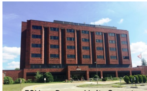
ESH — Regan Unit, Cranston

Our focus is on recognizing each patient's individuality and their right to dignified and high quality care.