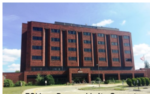
ESH — Regan Unit, Cranston

Our focus is on recognizing each patient's individuality and their right to dignified and high quality care.