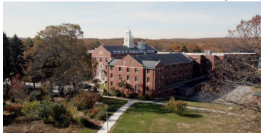
ESH — Zambarano Unit, Burrillville